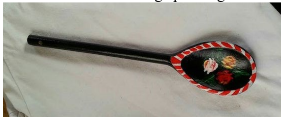
Traditional Barge painting

Crafts available for evenings - £1.50 per person charge for materials and tuition – please book in advance