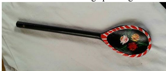
Traditional Barge painting

Crafts available for evenings - £1 per person charge for materials and tuition – please book in advance